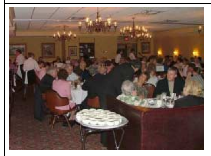
Dinner at Tambellini's