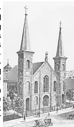
St. Anthony Chapel

The most frequently heard comment among our guests was that the meal was exceptionally outstanding. Compliments covered every aspect of our German meal, from the main entrée (pork loin), to the sour kraut, to the fact that the food was