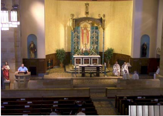
Mass at St. Boniface Church