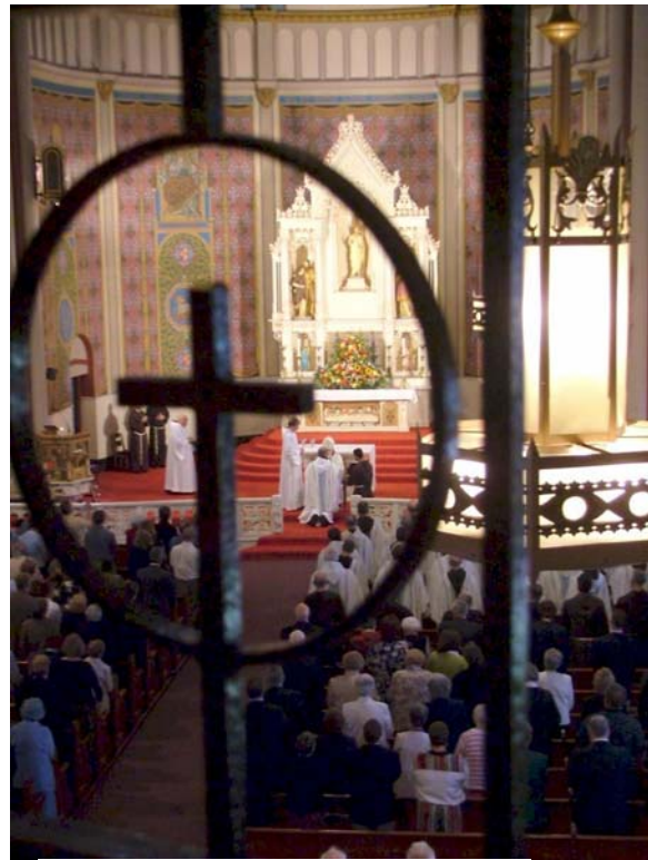
Some of Greg's family and friends