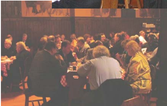
▲ ◀ Dinner at The Mannechor Club