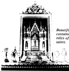
Beautifully contains relics of saints.